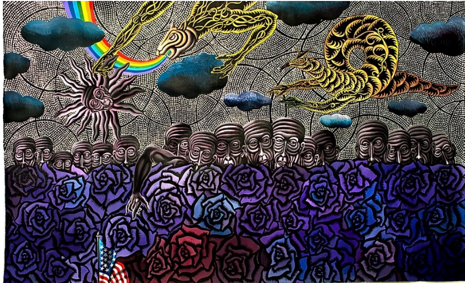
HENRY BERMUDEZ, THE WALL , 2018